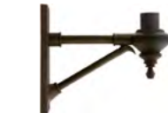
WM7421 / 16 3/8" x 15 3/4"