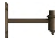
WM5601 / 17 7/8" x 14"