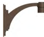
WM5163 / 15 3/4" x 13 3/4"