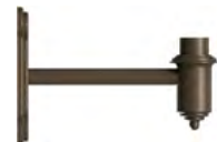
WM5601 / 17 7/8" x 14"