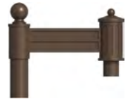
PA8523 / 18 1/4" x 14 1/2"