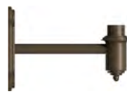
WM5601 / 17 7/8" x 14"