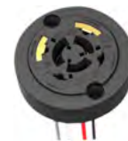
TL5 & TL7