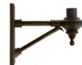
WM7421 / 16 3/8" x 15 3/4"