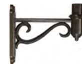
WM8021 / 19 1/4" x 16 3/8"