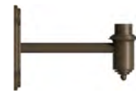
WM5601 / 17 7/8" x 14"