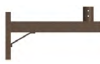
WM3001 / 11" x 8 7/8"