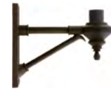
WM7421 / 16 3/8" x 15 3/4"