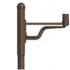
PA6211 / 22 3/4" x 26 1/2"