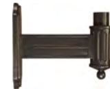
WM8581 / 17 1/8" x 17 1/2"