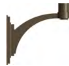
WM5161 / 15 3/4" x 17 3/4"