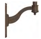
WM6111 / 20 3/8" x 24"