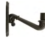
WM8831 / 17 1/4" x 16 3/8"