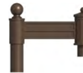
PA8523 / 18 1/4" x 14 1/2"