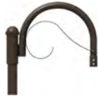
PA2023 / 20 1/4" x 16"