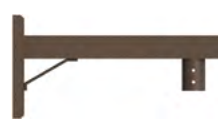
WM3003 / 11" x 8 7/8"