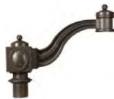
PA7813 / 21" x 23"