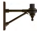
WM7421 / 16 3/8" x 15 3/4"