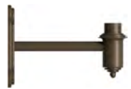
WM5601 / 17 7/8" x 14"