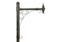
PA8443 / 36" x 24"