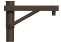
PA3113 / 25" x 15 1/4"