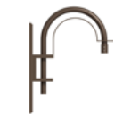
WM2313 / 23" x 31 7/8"