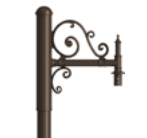
PA5613 / 18 5/8" x 26 1/2"