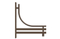
WM3553 / 28 1/4" x 36 1/2"