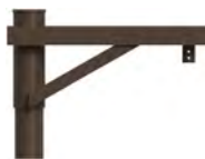
PA3113 / 25" x 15 1/4"