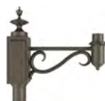
PA8031 / 20 1/2" x 20 1/4"