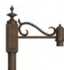
PA8033 / 20 1/2" x 20 1/4"