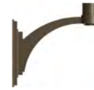
WM5161 / 15 3/4" x 13 3/4"