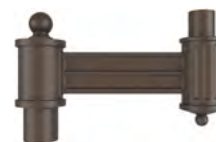
PA8521 / 18 1/4" x 14 1/2"