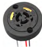
TL5 & TL7