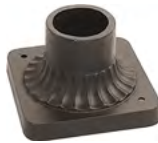
CM / 5 3/4" SQ x 3 1/2" H