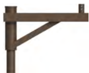
PA3111 / 25" x 15 1/4"

See Post Arm Section on Website for Specification Sheets and additional post arms. Dimensions are Projection x Height. Click here for all Post Mount styles