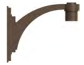
WM5163 / 15 3/4" x 13 3/4"