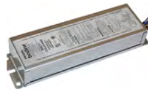
EMG-LED10, 20, 30