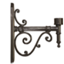
WM5611 / 17 5/8" x 22"