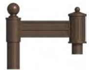
PA8523 / 18 1/4" x 14 1/2"