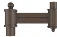
PA8521 / 18 1/4" x 14 1/2"