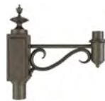
PA8031 / 20 1/2" x 20 1/4"