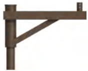
PA3111 / 25" x 15 1/4"

See Post Arm Section on Website for Specification Sheets and additional post arms. Dimensions are Projection x Height. Click here for all Post Mount styles