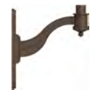
WM6111 / 20 3/8" x 24"