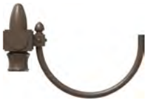
PA2131 / 29 1/2" x 17 3/8"

See Post Arm Section on Website for Specification Sheets and additional post arms. Dimensions are Projection x Height. Click here for all Post Mount styles