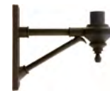
WM7421 / 16 3/8" x 15 3/4"