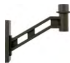
WM2211 / 15 1/2" x 15 7/8"