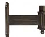
WM8581 / 17 1/8" x 17 1/2"