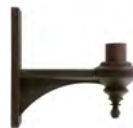
WM7411 / 14" x 15 3/4"