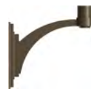
WM5161 / 15 3/4" x 17 3/4"