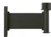
WM2221 / 13 1/2" x 13 1/4"