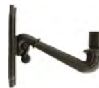
WM8831 / 17 1/4" x 16 3/8"