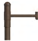
PA3321 / 18" x 14 3/4"