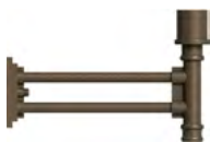
WM2141 / 18" x 12 3/16"

See Wall Mount Section on Website for Specification Sheets and additional wall mount arms. Dimensions are Projections x Height. Click here for all Wall Mount styles