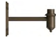
WM5601 / 17 7/8" x 14"