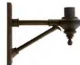
WM7421 / 16 3/8" x 15 3/4"