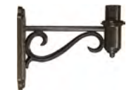
WM8021 / 19 1/4" x 16 3/8"