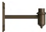
WM5601 / 17 7/8" x 14"