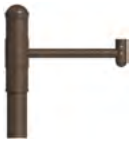
PA3321 / 18" x 14 3/4"

See Post Arm Section on Website for Specification Sheets and additional post arms. Dimensions are Projection x Height. Click here for all Post Mount styles