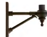
WM7421 / 16 3/8" x 15 3/4"