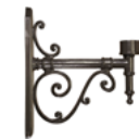
WM5611 / 17 5/8" x 22"