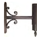
WM3351 / 14 1/2" x 17"