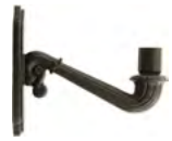
WM8831 / 17 1/4" x 16 3/8"