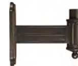
WM8581 / 17 1/8" x 17 1/2"