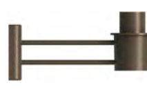
WM4511 / 17" x 8"