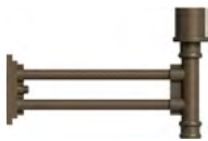
WM2141 / 18" x 12 3/16"

See Wall Mount Section on Website for Specification Sheets and additional wall mount arms. Dimensions are Projections x Height. Click here for all Wall Mount styles