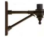
WM7421 / 16 3/8" x 15 3/4"