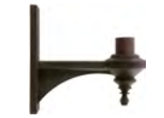
WM7411 / 14" x 15 3/4"