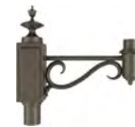
PA8031 / 20 1/2" x 20 1/4"