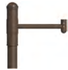
PA3321 / 18" x 14 3/4"