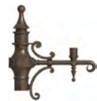
PA7711 / 13 1/8" x 21 1/2"