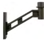
WM2211 / 15 1/2" x 15 7/8"