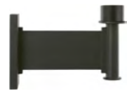
WM2221 / 13 1/2" x 13 1/4"