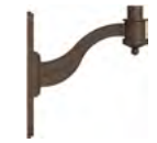
WM6111 / 20 3/8" x 24"