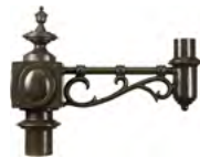
PA7911 / 20" x 20 5/8"