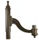
PA6111 / 20 1/2" x 25 1/8"