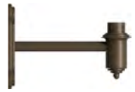
WM5601 / 17 7/8" x 14"