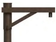
PA3113 / 25" x 15 1/4"