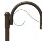
PA2023 / 21 1/4" x 16"