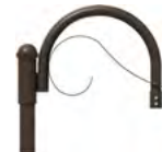
PA2023 / 21 1/4" x 16"