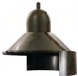
HSS90 & HSS120