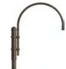
PA2613 / 39 1/2" x 46"