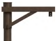
PA3113 / 25" x 15 1/4"