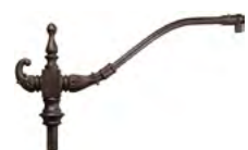
PA8453 / 70" x 37 1/2"