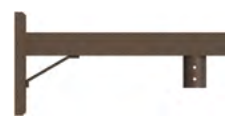
WM3003 / 11" x 8 7/8"