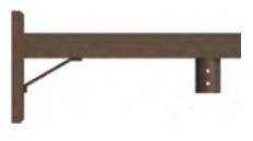
WM3003 / 11" x 8 7/8"