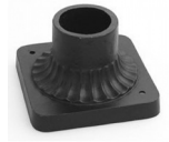
CM / 5 3/4" SQ x 3 1/2" H