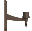
WM5131 / 11" x 16 3/8"