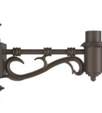
PA7911 / 20" x 20 5/8"