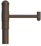
PA3321 / 18" x 14 3/4"