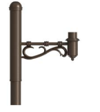
PA5621 / 19" x 26 1/4"