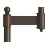
PA8521 / 18 1/4" x 14 1/2"