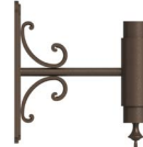
WM3351 / 14 1/2" x 17"