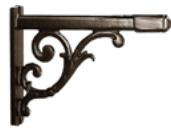
WM5313 / 10 7/8" x 10"