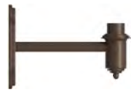
WM5603 / 17 7/8" x 14"