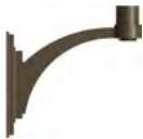
WM5161 / 15 3/4" x 17 3/4"