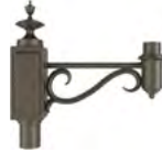
PA8031 / 20 1/2" x 20 1/4"