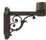
WM5311 / 10 7/8" x 10"