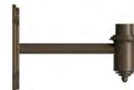
WM5601 / 17 7/8" x 14"