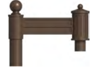
PA8523 / 18 1/4" x 14 1/2"