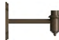
WM5601 / 17 7/8" x 14"