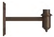
WM5603 / 17 7/8" x 14"