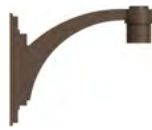
WM5163 / 15 3/4" x 13 3/4"