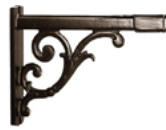
WM5313 / 10 7/8" x 10"