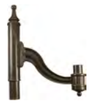
PA6111 / 20 1/2" x 25 1/8"