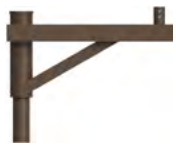
PA3111 / 25" x 15 1/4"

See Post Arm Section on Website for Specification Sheets and additional post arms. Dimensions are Projection x Height. Click here for all Post Mount styles