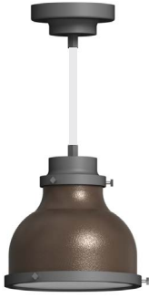
MA08 8" Madison - LED