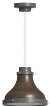
MA10 10" Madison - LED