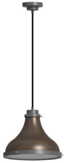
MA14 14" Madison - LED