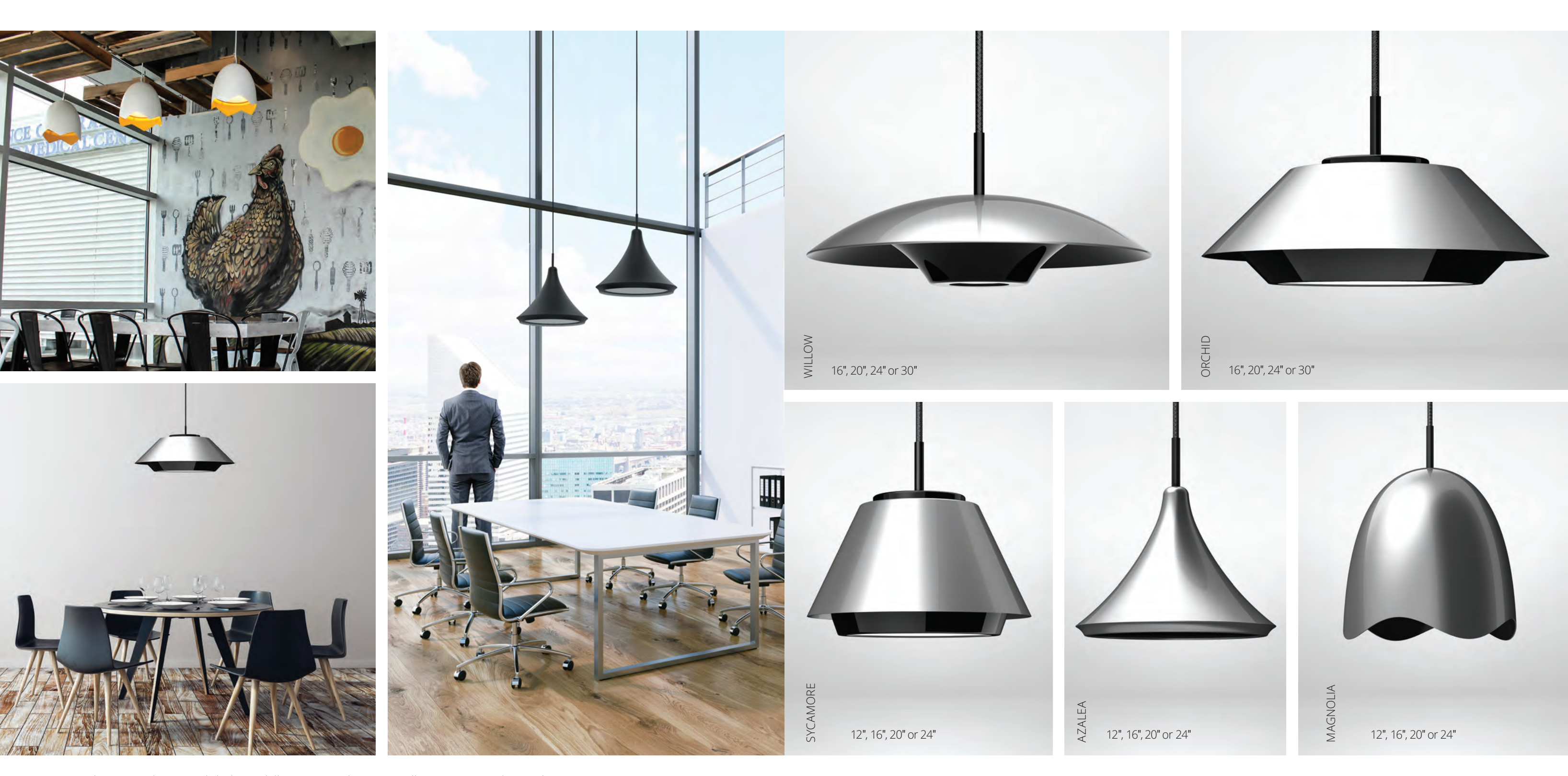
Pairing design aesthetics with balanced illumination, the M+D Collection's versatile pendant luminaires have just the right look and proportion for office spaces, restaurants and bars, hotels, retailers, and campuses.