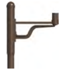
PA6211 / 22 3/4" x 26 1/2"