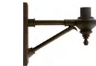
WM7421 / 16 3/8" x 15 3/4"