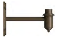
WM5601 / 17 7/8" x 14"