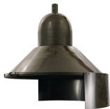
HSS90 & HSS120