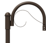
PA2023 / 21 1/4" x 16"