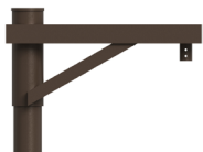
PA3113 / 25" x 15 1/4"