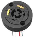
TL5 & TL7