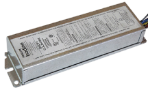
EMG-LED10, 20, 30