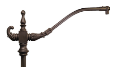
PA8453 / 70" x 37 1/2"