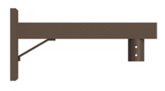
WM3003 / 11" x 8 7/8"