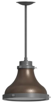
MA10 10" Madison - LED