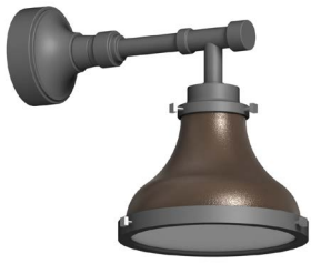
MA10 10" Madison - LED