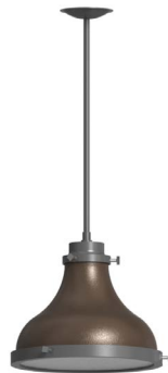
MA12 12" Madison - LED