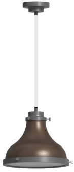
MA12 12" Madison - LED