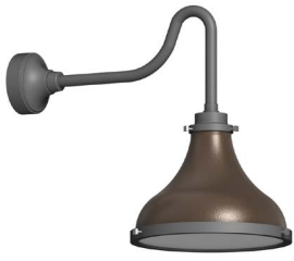
MA14 14" Madison - LED