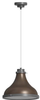
MA14 14" Madison - LED