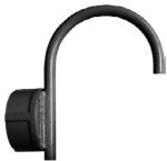
WM40 | 13 7/8" x 14 3/4"