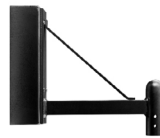
WM317 | 15" x 12 3/4"