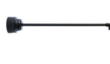
E12 | 40 3/8" x 2"