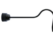
E11 | 38 1/4" x 17 1/4"