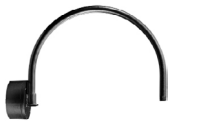
WM54 | 23 3/8" x 18"