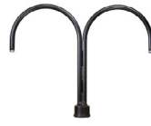
PM20 | 30 1/8" x 25"