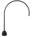
E9 | 28" x 43 5/8"