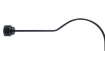
E10 | 55 1/4" x 18"