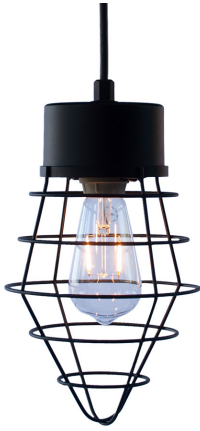
Lamp not included.