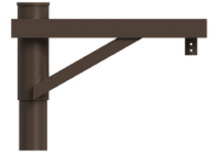
PA3113 / 25" x 15 1/4"