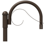
PA2023 / 21 1/4" x 16"