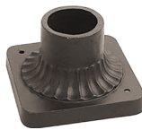
CM / 5 3/4" SQ x 3 1/2" H